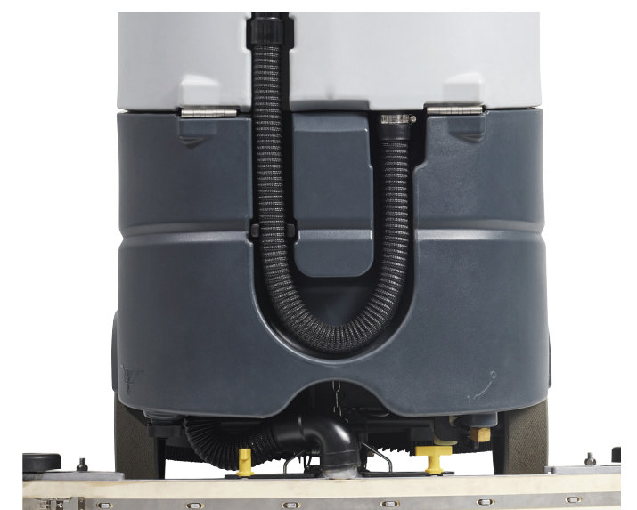
14. Take the squeegee off and remove debris. Check and clean the squeegee blades.