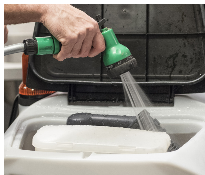
11. Wash with fresh water the recovery tank and the vacuum grid.