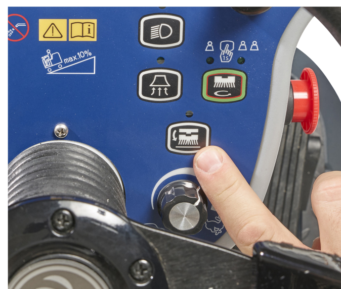
12. Press the click-off button and wait for the brush/pad holder to fall on the floor.