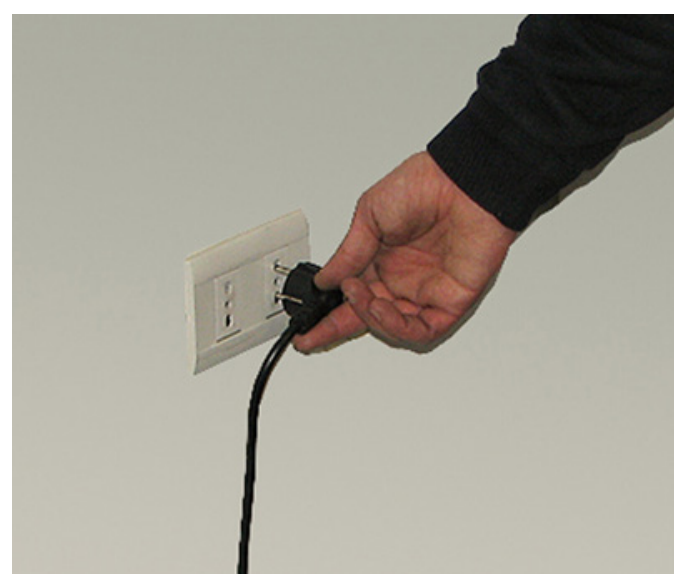
16. Charge the batteries: Connect the battery charger cable to the electrical socket.