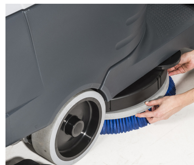
13. Remove to clean or change brush.