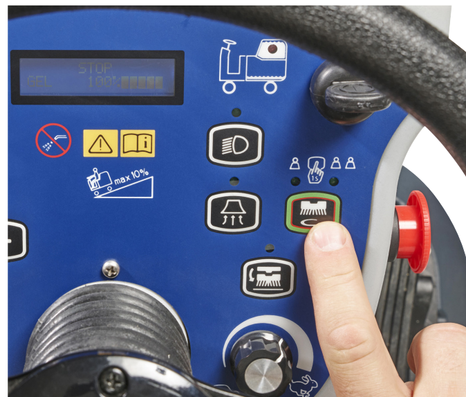
6. Insert the operator key and start the machine. Lower the brush by pressing the brush button.