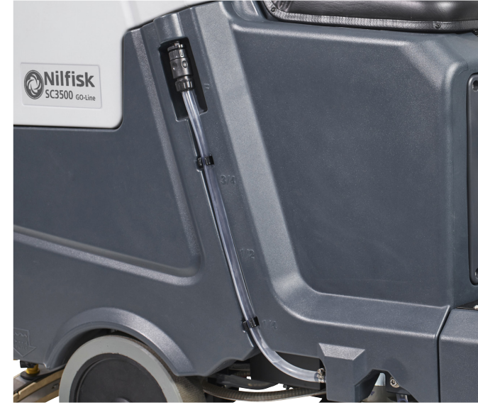
3. Solution level indicator is on the side of the tank shows current level.