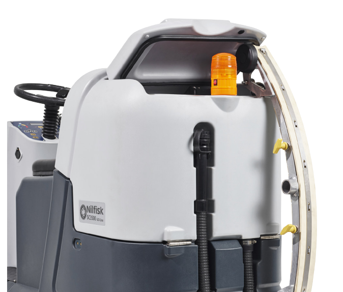
17. Park the machine with the recovery tank cover open.

If the machine has been used until the Red light illuminates on the battery level indicator on the machine, a full recharge of the batteries (10-12 hours) will be required. Failure to carry out this procedure may cause damage to the batteries. Charging the batteries after every use is recommended.