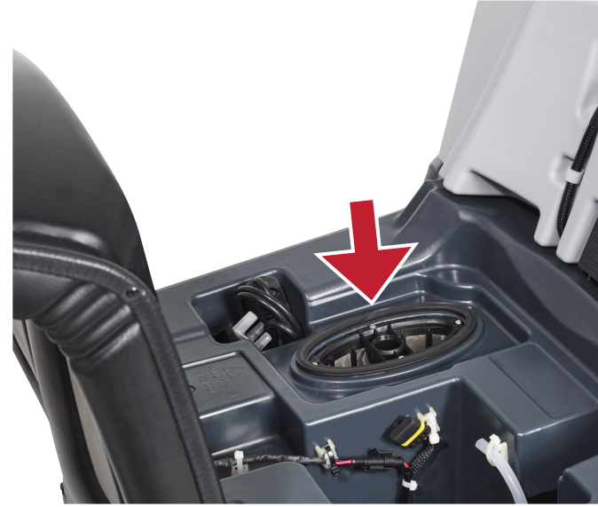
2. Fill the solution tank with fresh water. The fresh water temperature must not exceed 40 °C.