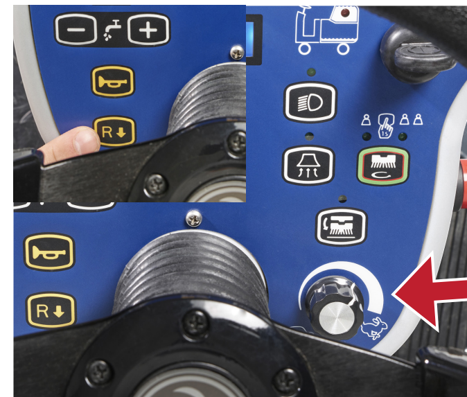
7. Push the drive pedal to start cleaning. Adjust the maximum forward speed by the speed potentiometer. For the reverse mode press the R on the control panel.