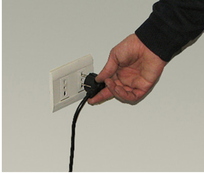
1b. Disconnect the battery charger cable from the mains electricity supply.