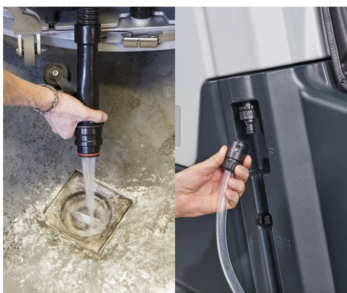
10. Once you have finished cleaning empty the recovery tank with the hose. Then empty the solution tank with the transparent hose.