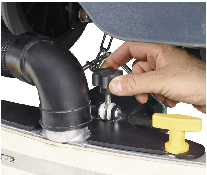
4. Adjust squeegee angle and blade pressure for optimal water pick-up by turning the adjustment knob on the support.