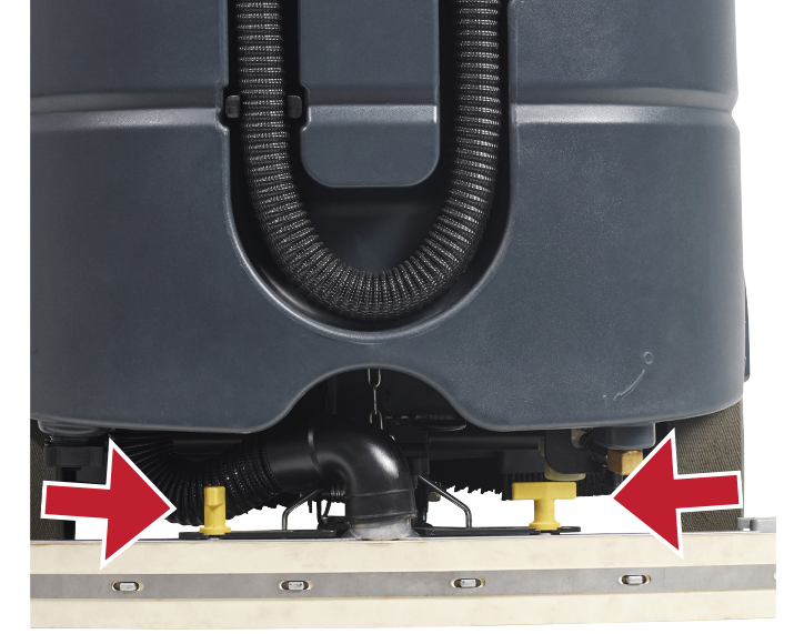
3. If the squeegee is not connected to the machine: install and fasten it by using the two knobs, then connect the suction hose.