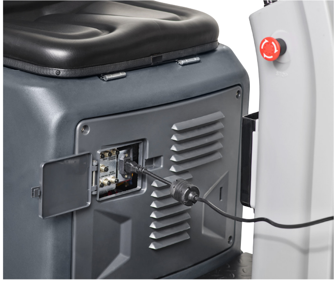
1a. Disconnect battery charger and store the cable.

ATTENTION! Do not use the machine before you have read and understood the Instructions for User Manual