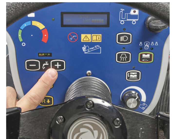
8. Adjust (if needed) the solution flow level according to the cleaning performance and application.