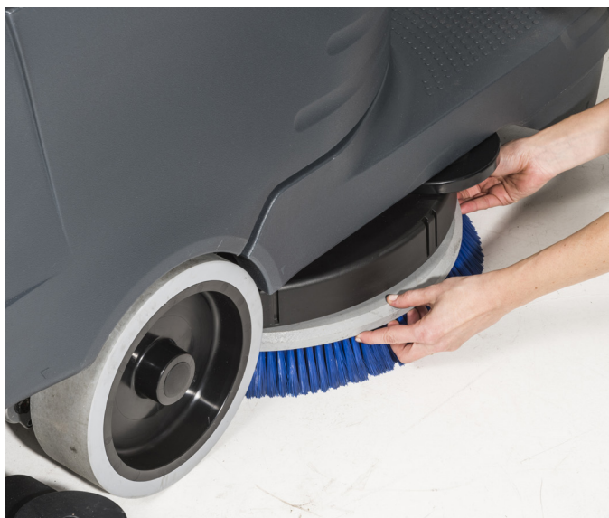
5. Place the brush or the pad-holder under the deck and install it manually. Use the appropriate brush to clean the floor.